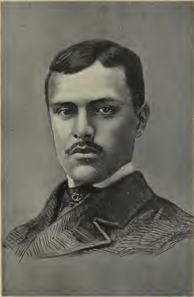
PRINCE VICTOR NAPOLEON IN YOUTH.